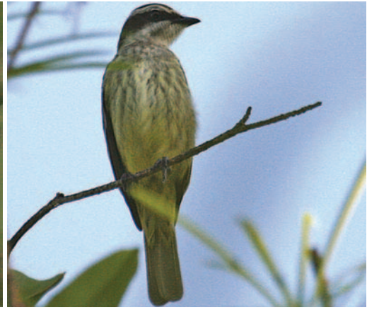
Fig. 17: Legatus leucophaius (Piratic Flycatcher).