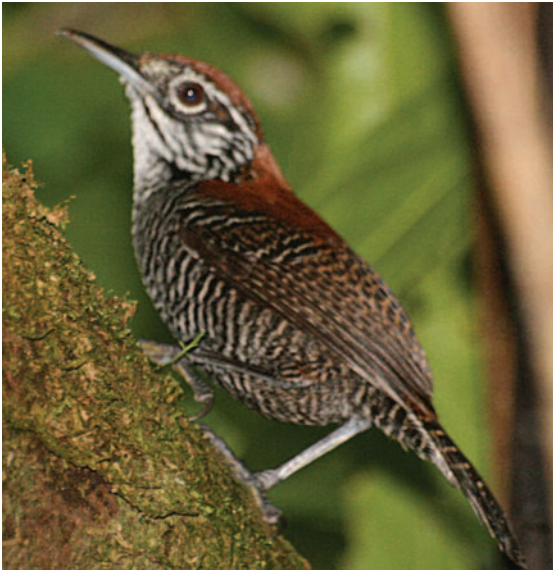
Fig. 18: Thryothorus semibadius (Riverside Wren).