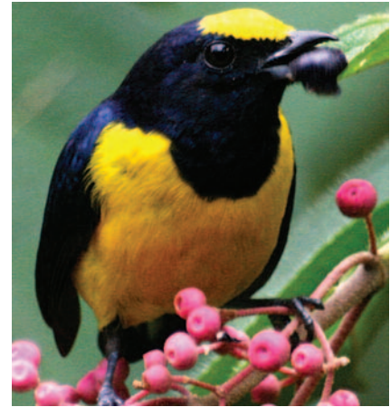
Fig. 24: Euphonia imitans (Spot-crowned Euphonia).