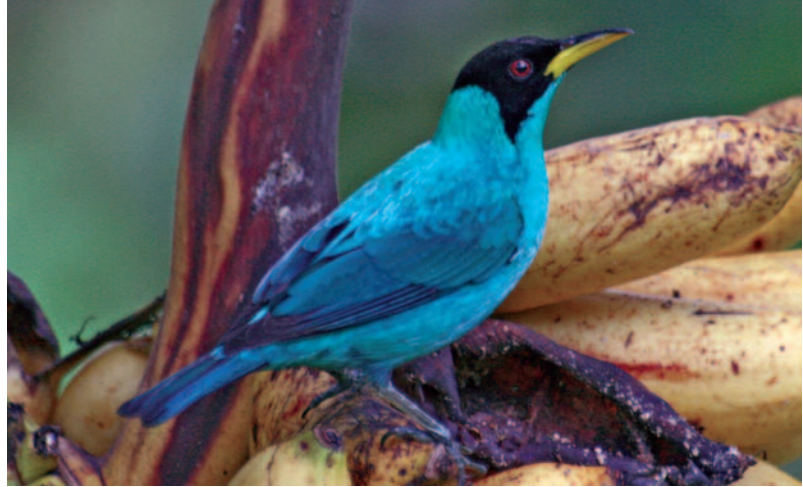
Fig. 22: Chlorophanes spiza (Green Honeycreeper).