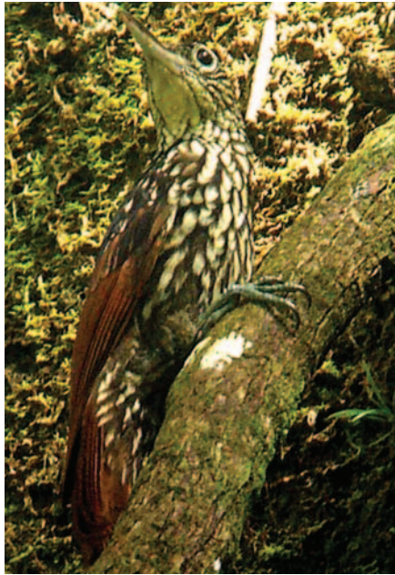
Fig. 14: Xiphorhynchus lachrymosus (Black-striped Woodcreeper).