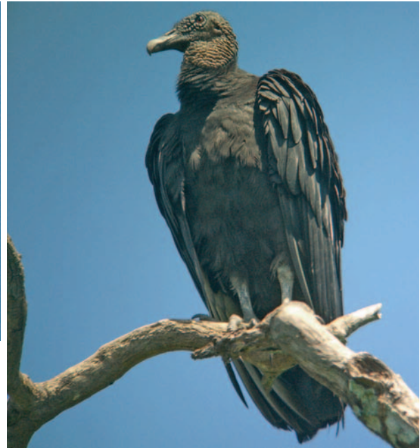
Fig. 5: Sarcorampus papa (King Vulture).