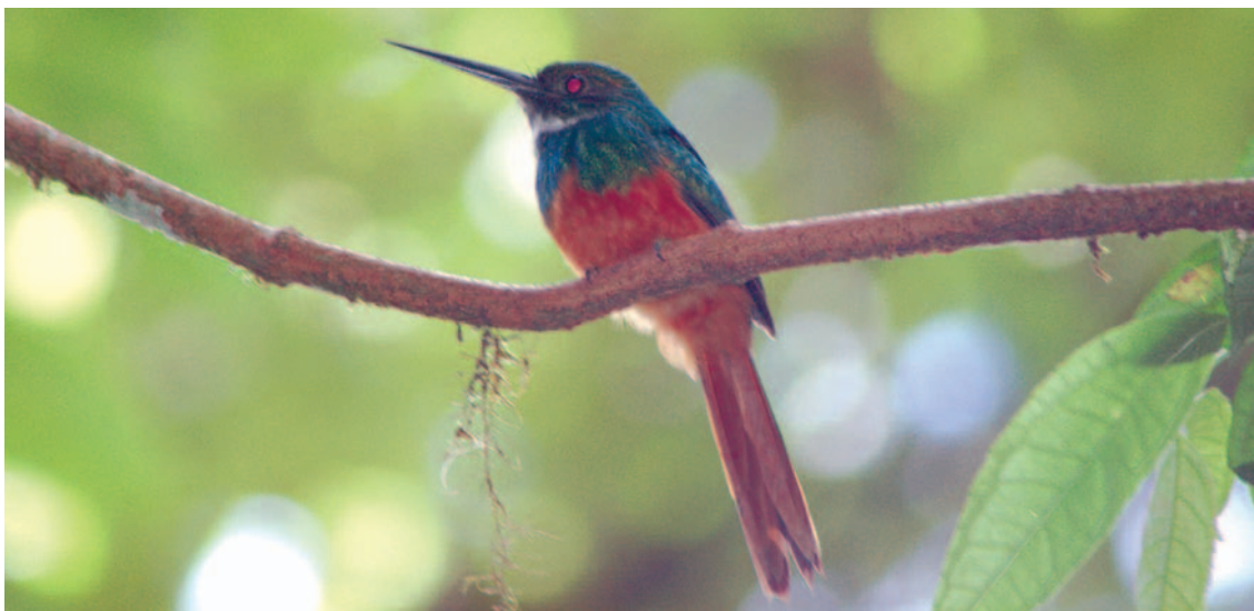
Fig. 12: Galbula ruficauda (Rufous-tailed Jacamar).