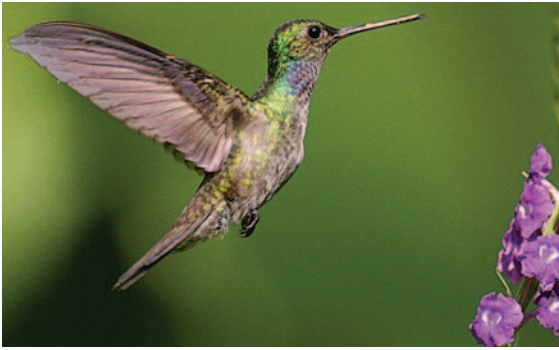
Fig. 9: Amazilia decora (Charming Hummingbird).