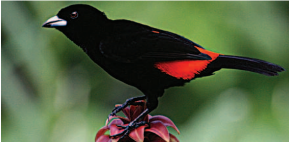
Fig. 21: Ramphocelus costaricensis (Cherrie's Tanager).