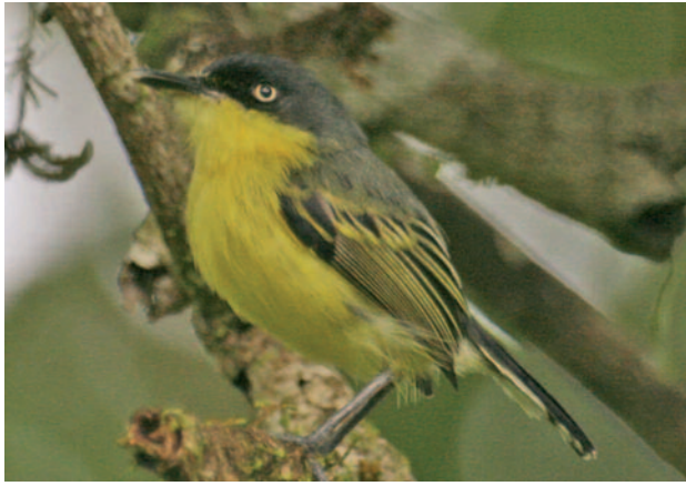
Fig. 16: Todiostrostrum cinereum (Common Tody-Flycatcher).