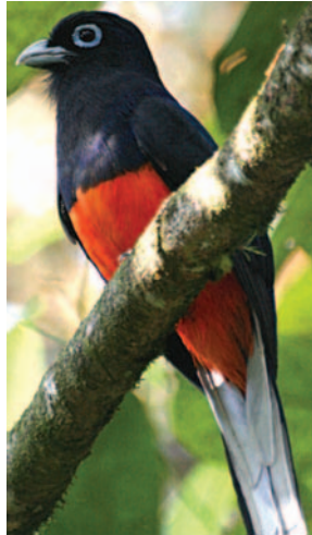
Fig. 10: Trogon bairdii (Baird's Trogon).