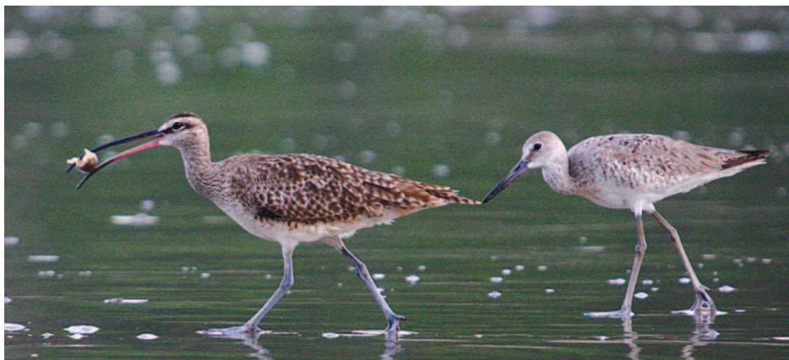
Fig. 6: Numenius phaeopus (Whimbrel) and Tringa semipalmata (Willet).