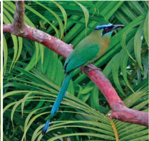
Fig. 11: Momotus momota (Blue-crowned Motmot).