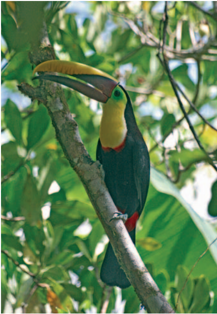
Fig. 13: Ramphastos swainsonii (Chestnut-mandibled Toucan).