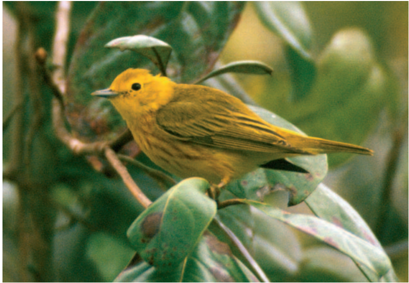
Fig. 19: Dendroica petechia (Yellow Warbler).