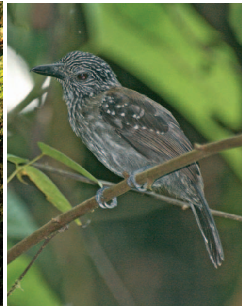
Fig. 15: Thamnophilus bridgesi (Black-Hooded Antshrike).