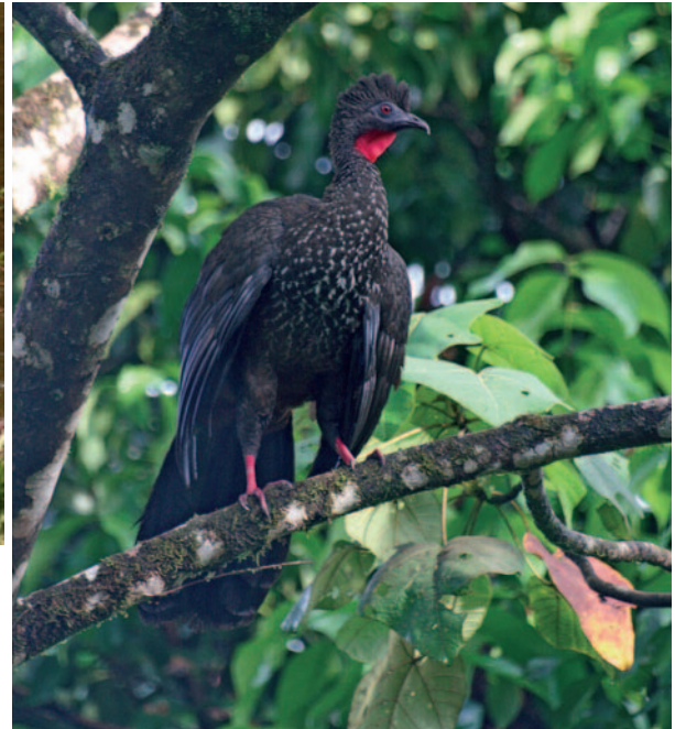
Fig. 3: Penelope purpurascens (Crested Guan).