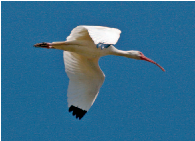
Fig. 4: Eudocimus albus (White Ibis).