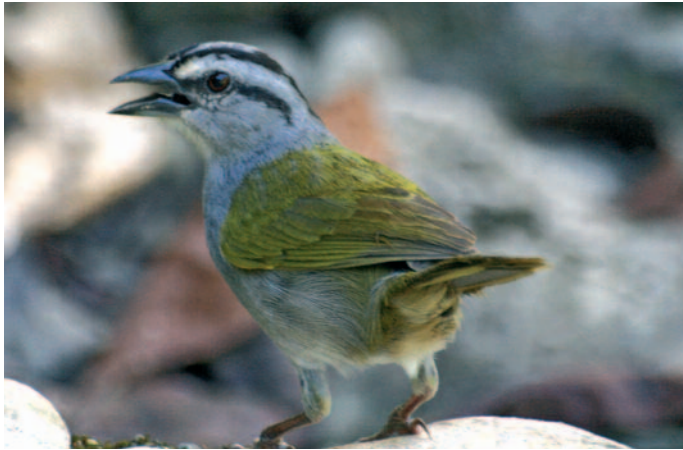
Fig. 23: Arremonops conirostris (Black-striped Sparrow).