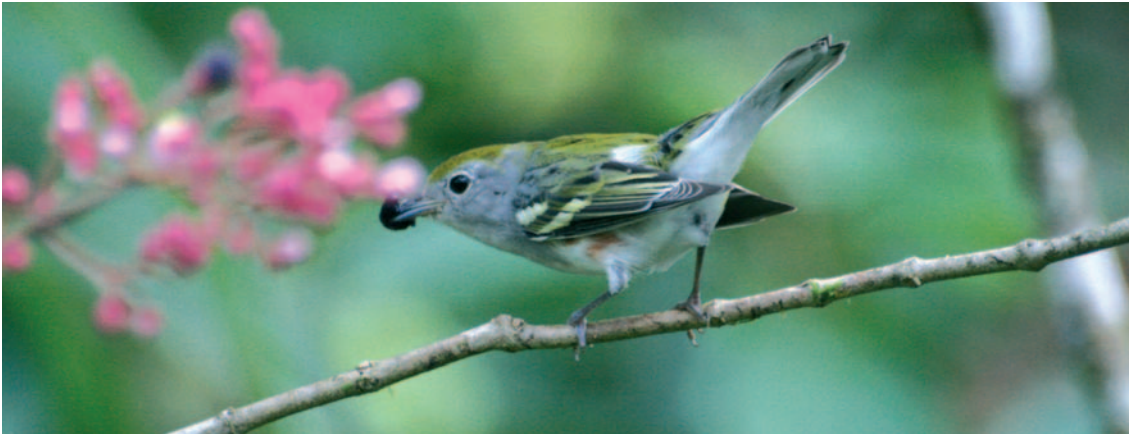
Fig. 20: Dendroica pensylvanica (Chestnut-sided Warbler).