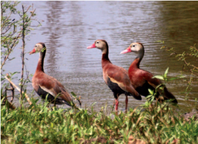
Fig. 2: Dendrocygna autumnalis (Black-bellied Whistling-Duck)